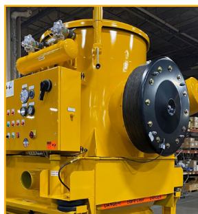
Full Explosion-Proof Options List