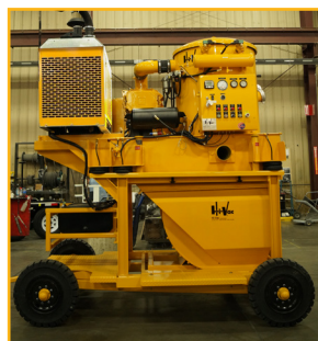
Available In-Plant & Highway Trailers