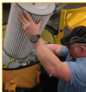
Easy Baghouse Access